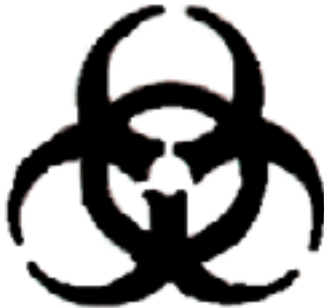
Figure 2 Biohazard Symbol

Reusable waste containers must be cleaned regularly to prevent odours and as soon as possible if waste materials leak or spill within the containers.