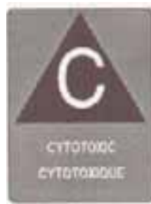
Figure 3 Cytotoxic Hazard Symbol

It may also be useful to users if sharps containers have: a fill line; features permitting simplified movement and handling of filled containers before disposal; means by which unauthorized individuals are prevented from removing items from the container or from removing the container itself; a design that allows stacking, to decrease storage space; and features that allow the sharps container to be attached to medication and/or treatment carts.