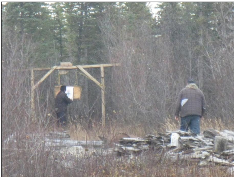
Scope target 100 metres.