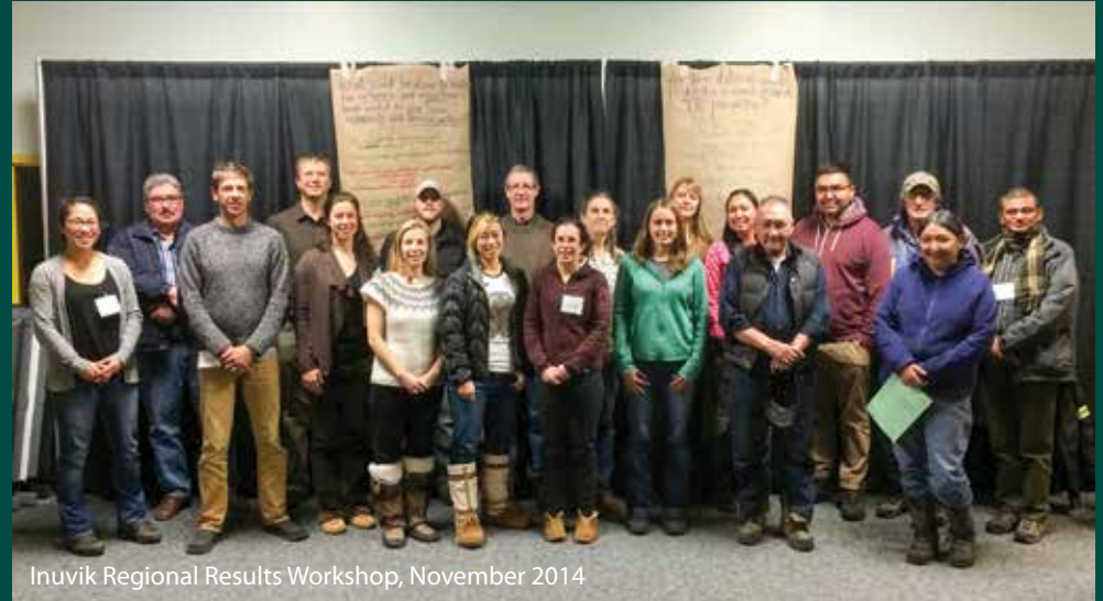
Inuvik Regional Results Workshop, November 2014

23 environmental trend reports are available on nwtcimp.ca .