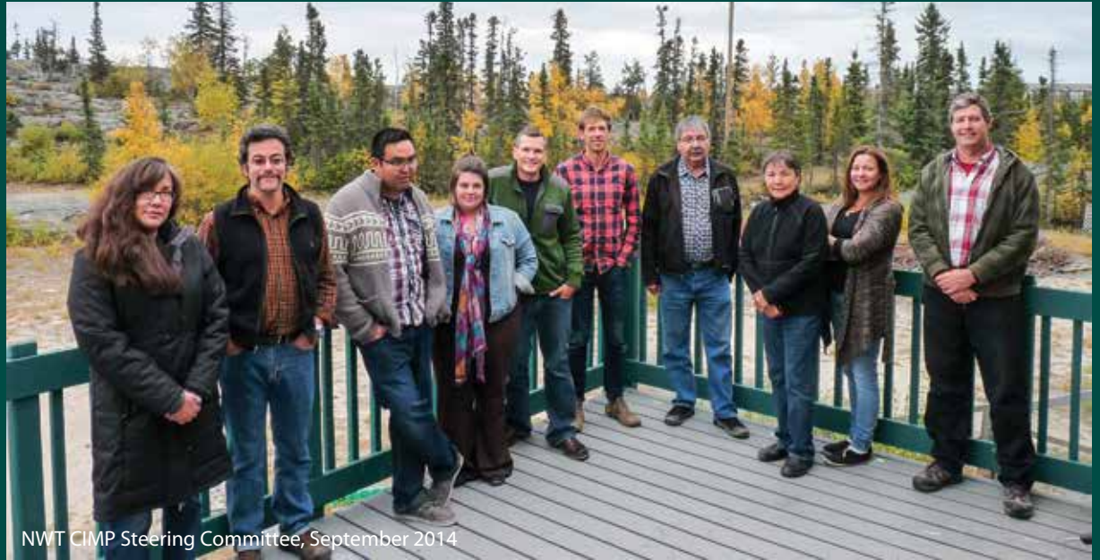
NWT CIMP Steering Committee, September 2014

of NWT CIMP projects in 2014/15 were led by or partnered with a regional Aboriginal, community or co-management organization.