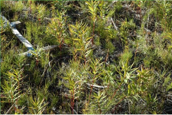
Fireweed ( Epilobium angustifolium ) and Goldenrods ( Solidago spp.) difficult to ID further as there are no flower structures. (Herbs)