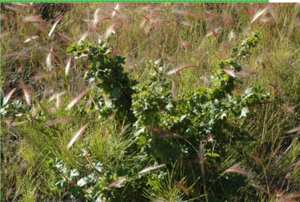
Foxtail Barley - Hordeum jubatum (grass) Wild Black Current ( Ribes americana ) (shrub)