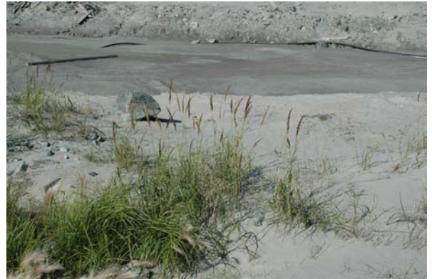
Wheatgrass - Agropyron trachycaulum