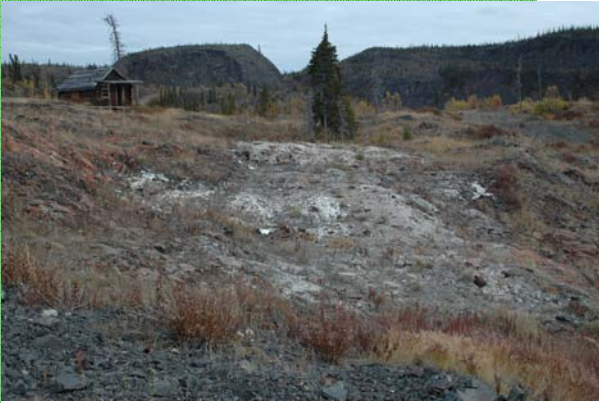
Western Dock - Rumex occidentalis (Herb) + Foxtail Barley - Hordeum jubatum (grass) + Grass Agropyron spp. (exposed tailings and rock cover area)