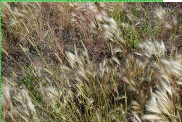
Foxtail Barley - Hordeum jubatum (grass)