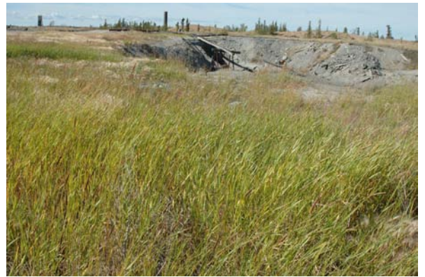
Wheatgrass Agropyron trachycaulumm also called Elymus trachycaulumm and maybe some small amount of Polargrass ( Arctagrostis latifolia )