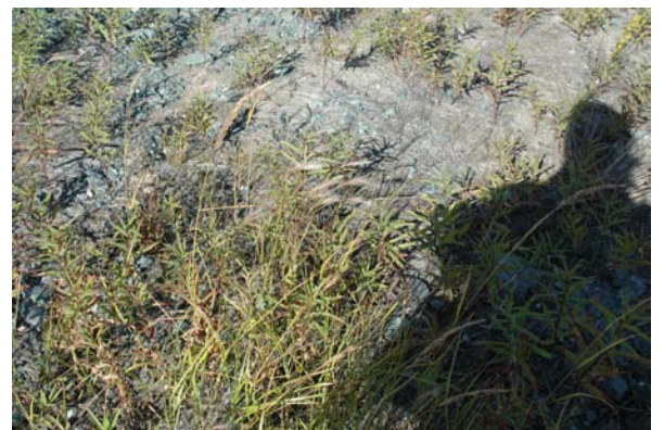
wheatgrass Agropyron trachycaulumm also called Elymus trachycaulumm (grasses) + Foxtail Barley - Hordeum jubatum (grass)