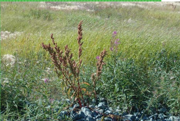
Western Dock - Rumex occidentalis (Herb)