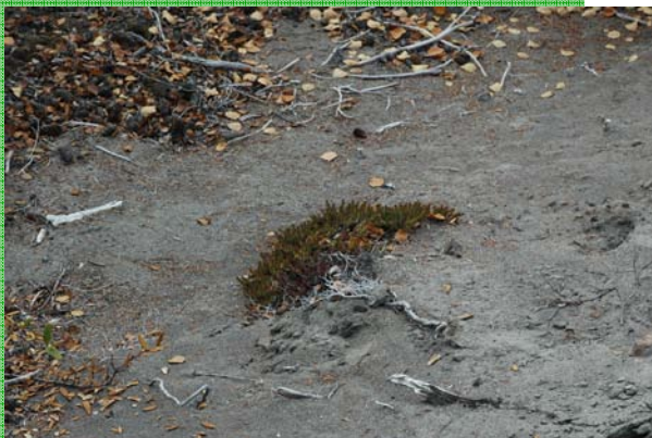
Stiff Club Moss Lycopodium annotinum (exposed tailings)