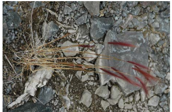
Foxtail Barley - Hordeum jubatum