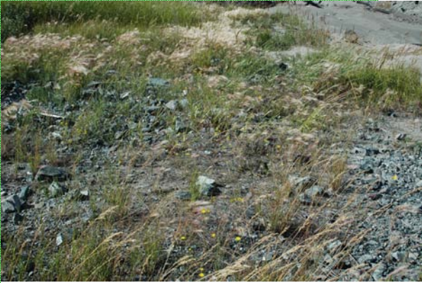
Hawkweed - Hieracium umbellatum (herb)