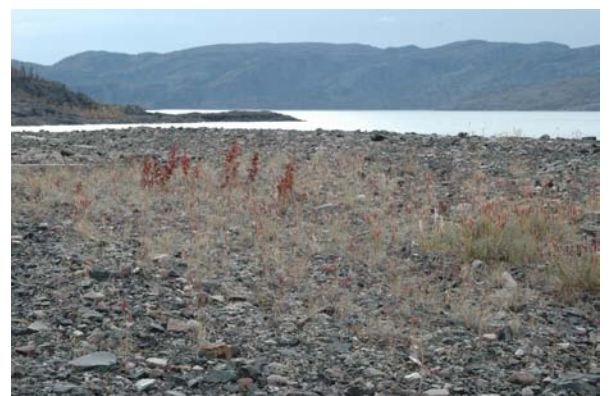
Western Dock - Rumex occidentalis (Herb) + Foxtail Barley - Hordeum jubatum (grass)