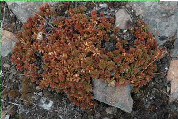
Saxifrage – Saxifraga + Stonecrop Sedum (Directly adjacent to capped tailings)