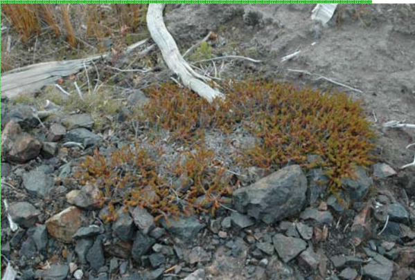
Stonecrop Sedum spp. (exposed tailings/rock cover interface)