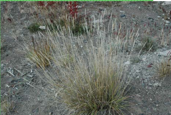
Grass Agropyron spp.