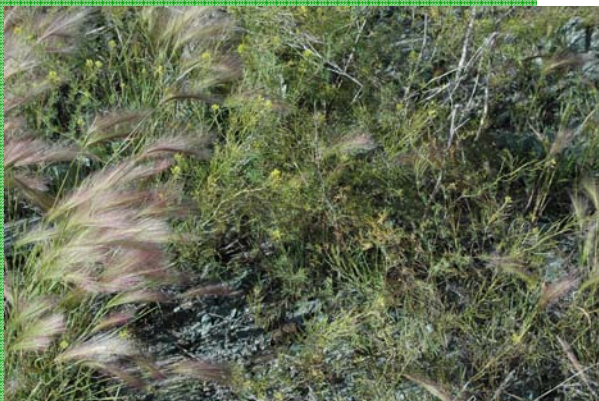
Foxtail Barley - Hordeum jubatum (grass) + Hawkweed - Hieracium umbellatum (herb)