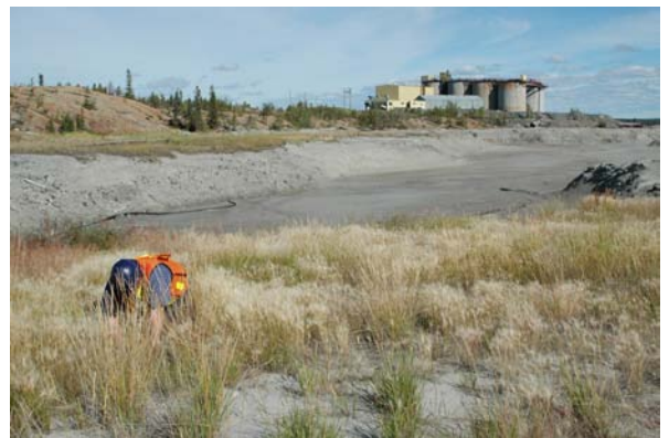
Foxtail Barley - Hordeum jubatum (grass)