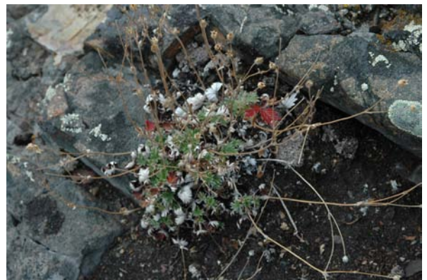
Three leaved cinquefoil Potentilla tridentate herb (directly adjacent to tailings cap)