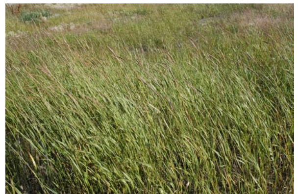
Wheatgrass - Agropyron trachycaulum