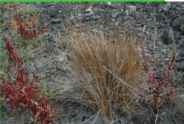
Sedge (tailings cap)