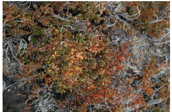
White Arctic Mountain Heather Cassiope tetragona (Shrub) + Saxifraga + Mossy Stonecrop Sedum spp.