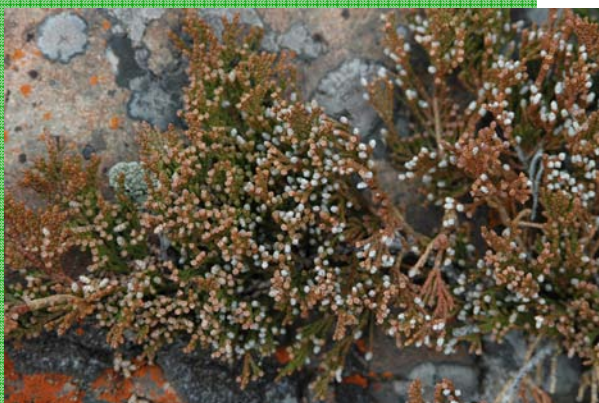
White Arctic Mountain Heather Cassiope tetragona (Shrub) (directly adjacent to tailings cap)