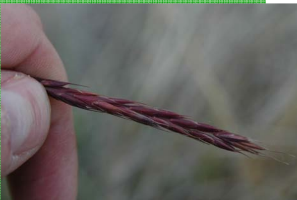
Wheatgrass Agropyron trachycaulum