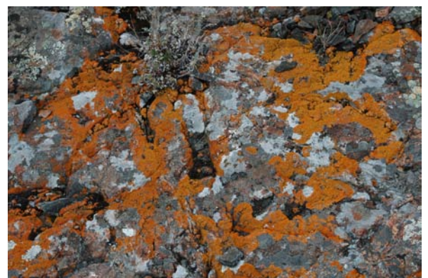
Pincushion orange Xanthoria polycarpa + grey lichen (unkown) (directly adjacent to covered tailings)