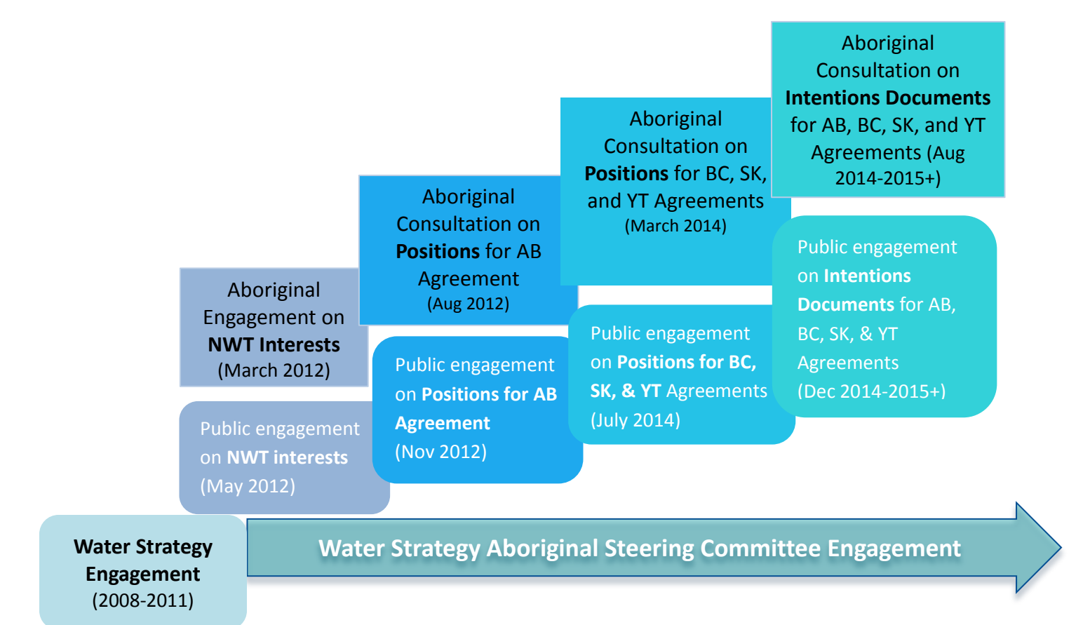
Figure 1. The approach to Aboriginal consultation and public engagement for Transboundary Water Management Agreements builds on engagement for the NWT Water Stewardship Strategy. The Water Strategy Aboriginal Steering Committee was formed in 2009 to guide Water Strategy development and has been engaged throughout the negotiation of Transboundary Water Management Agreements.