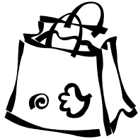
Take a Cloth Bag

The cash register receipt shows the number of bags and total surcharge.