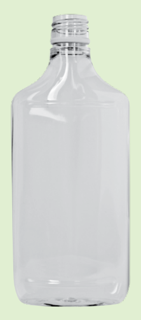
Liquor Bottle (all sizes)