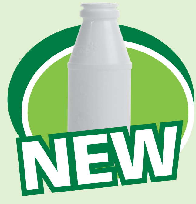
Yogurt Drink Bottle