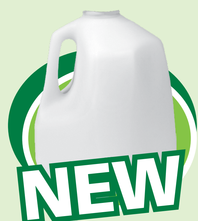
2L or 4L Milk Jug