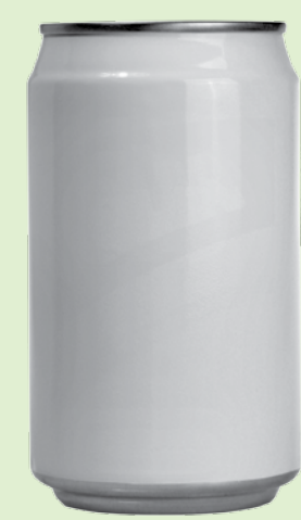
Pop or Beer Can