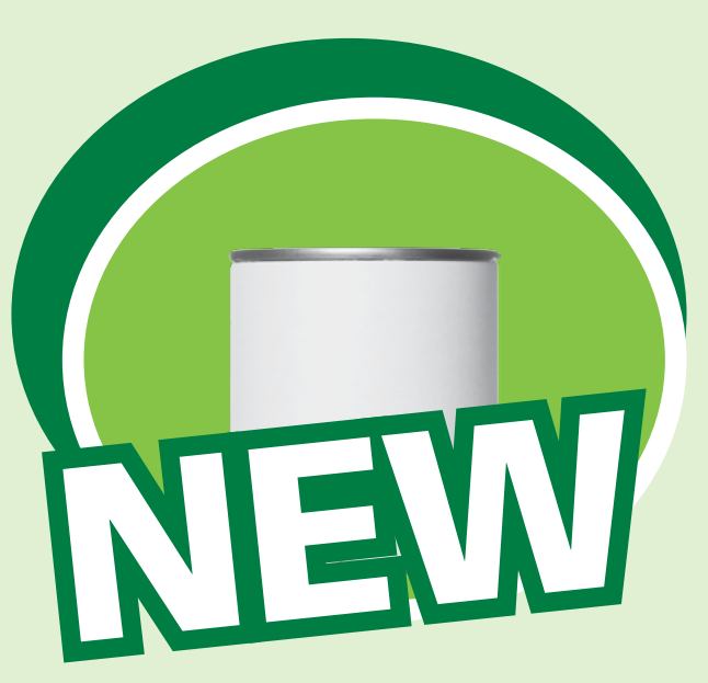
Condensed or Evaporated Milk Can