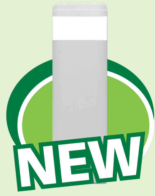
1L or less Milk or Milk Substitute Carton