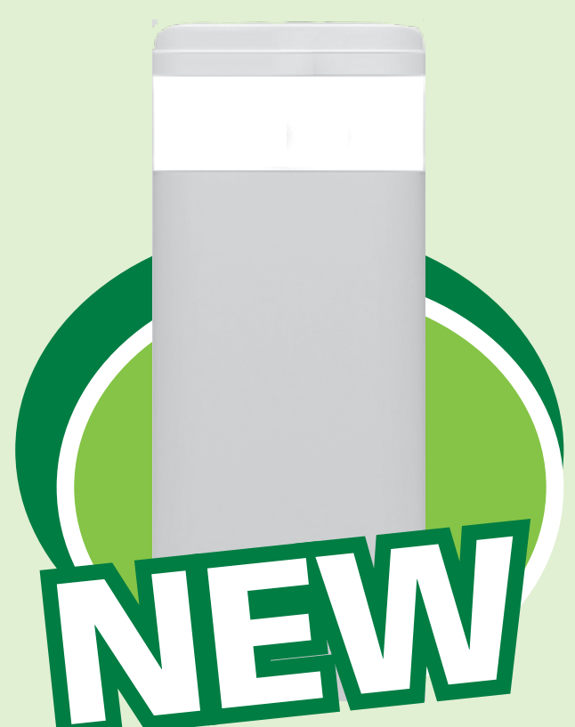
2L Milk or Milk Substitute Carton